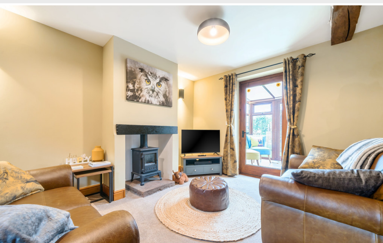
Living / Dining Room