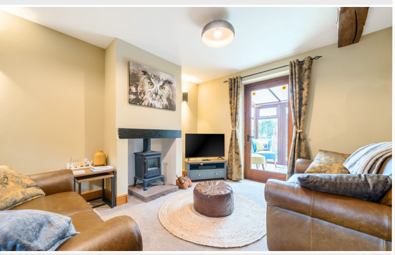
Living / Dining Room