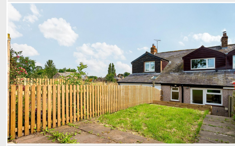
Rear Aspect and Garden