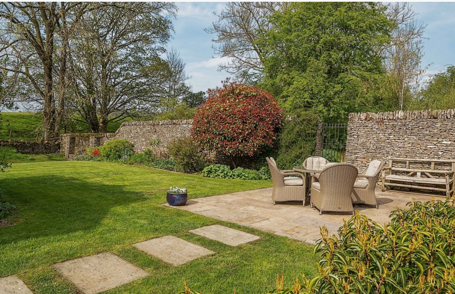
Rear Garden and Patio