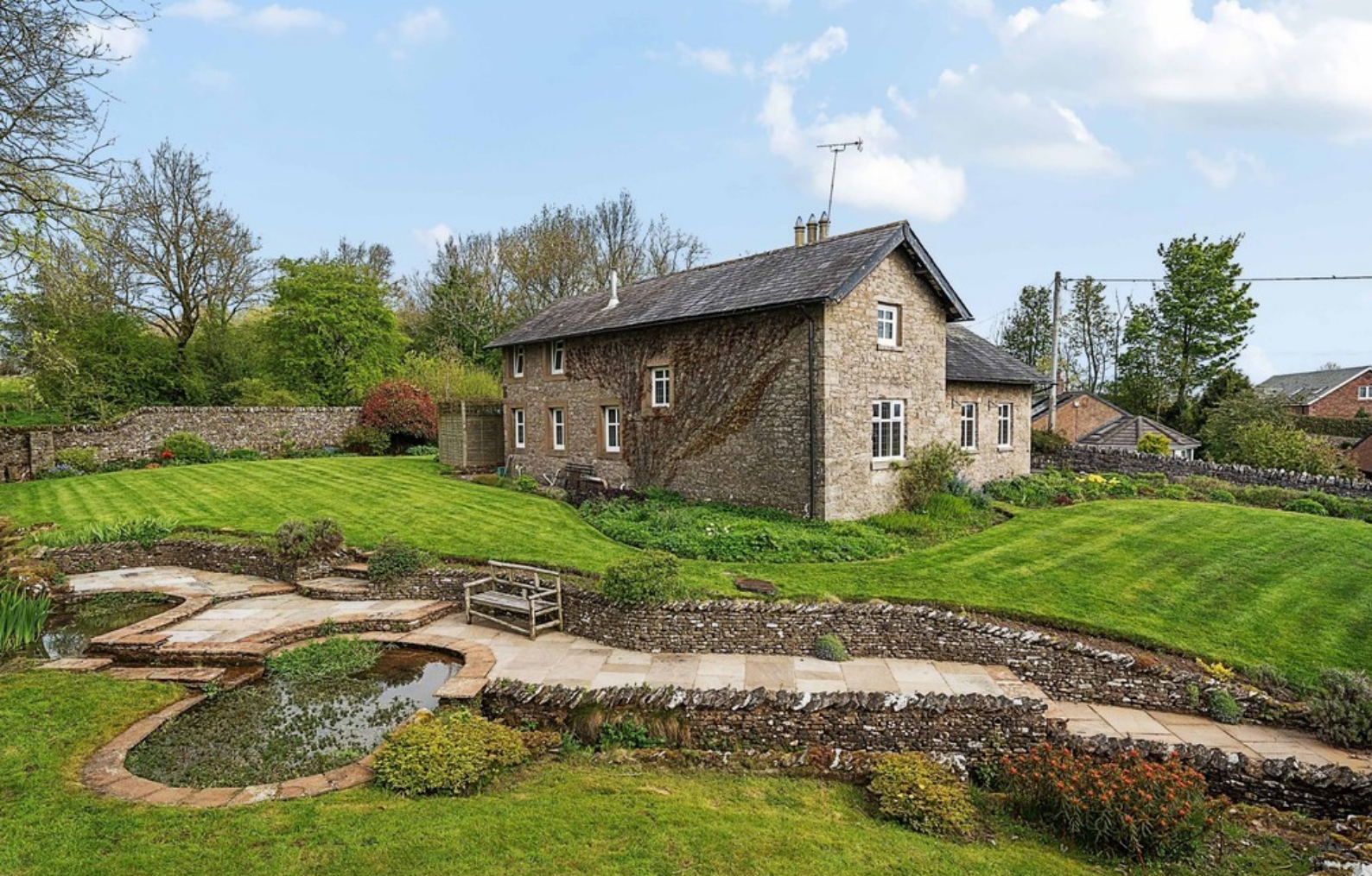
Rear elevation and garden