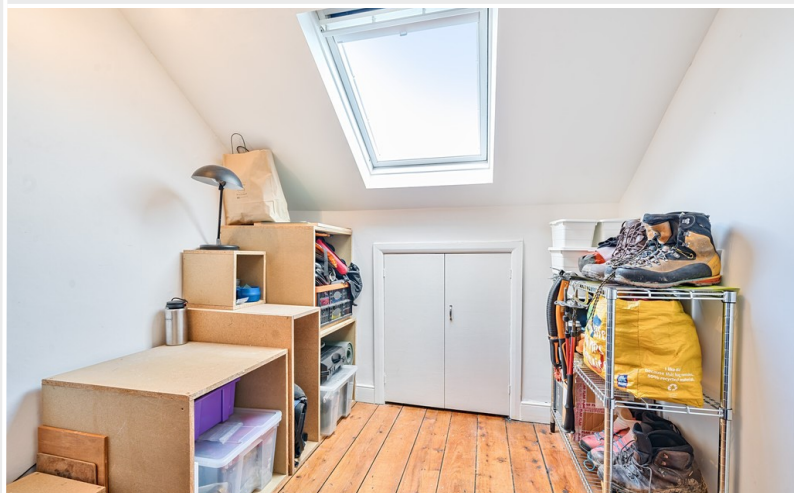
Bedroom 4 / Study