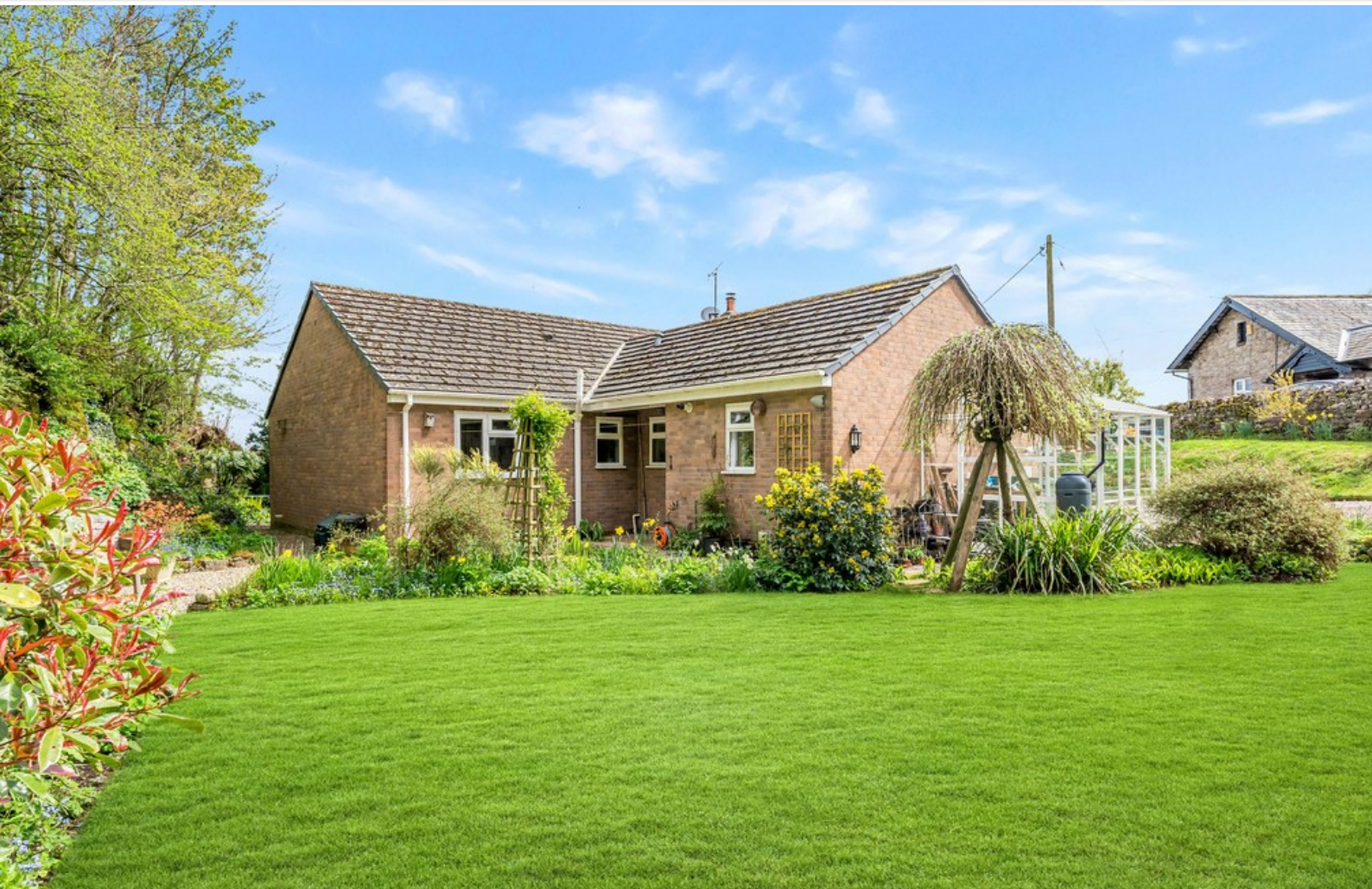
Rear Elevation and Garden