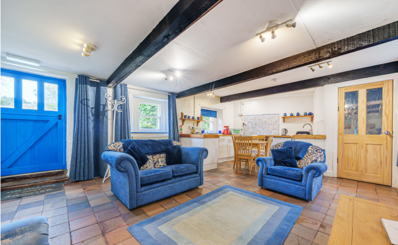
The Old Tearoom Living Room / Kitchen