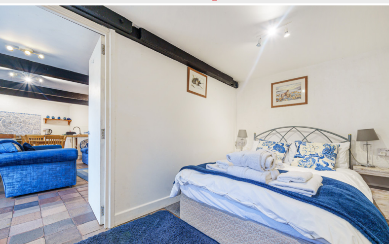
The Old Tearoom Bedroom One