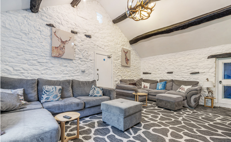
Mill House Sitting Room