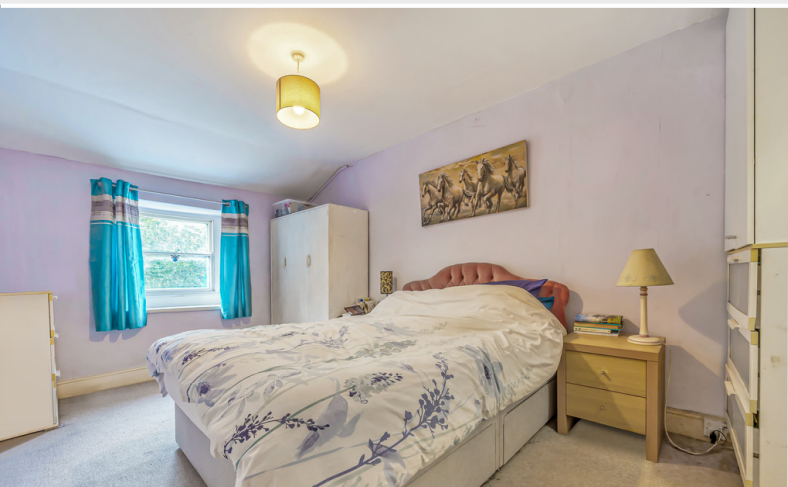
Mill House Bedroom Three