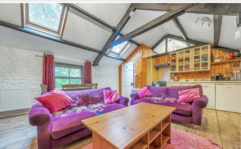
Heron Cottage Living Room / Kitchen