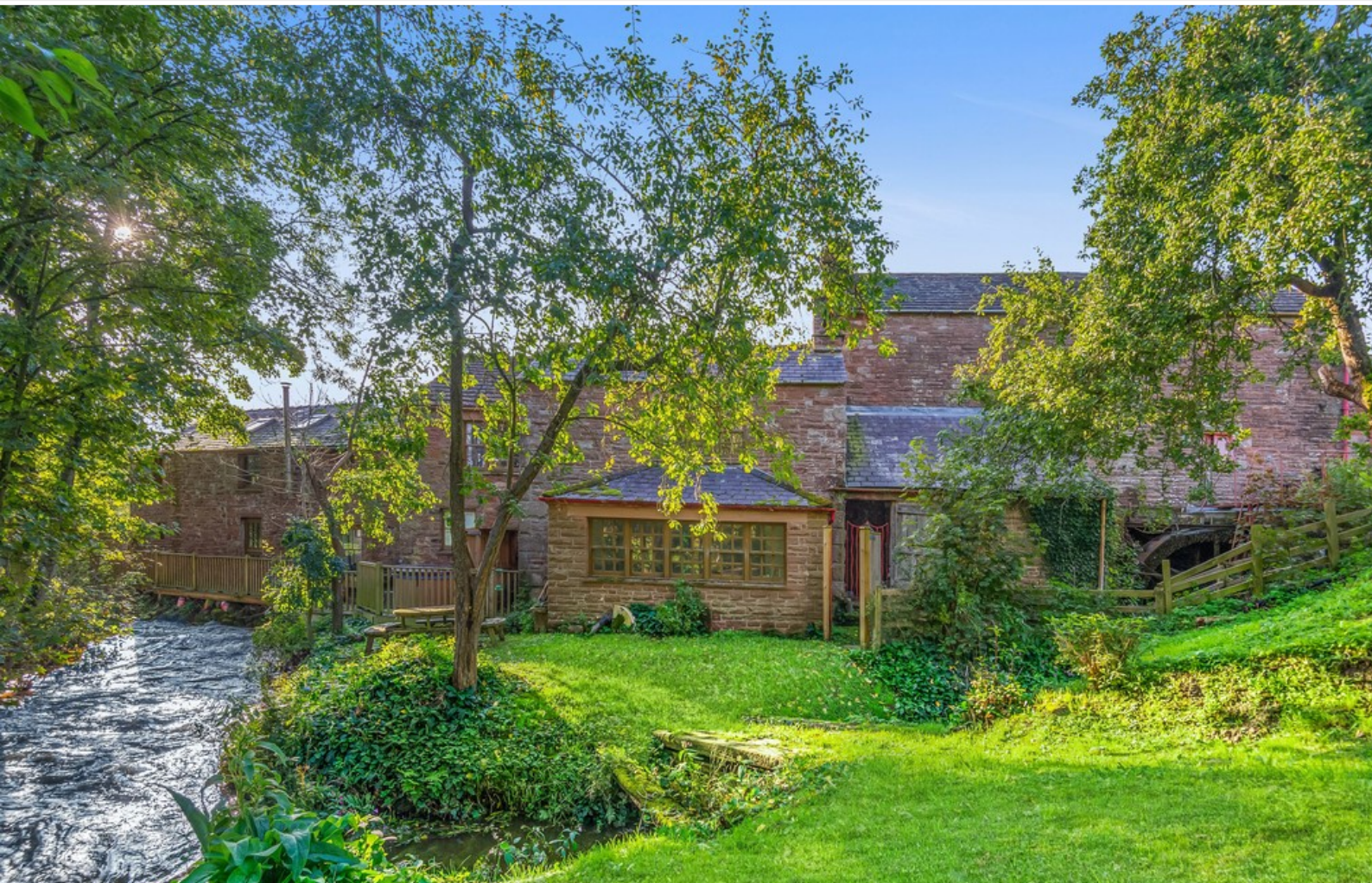
Rear Elevation and Garden