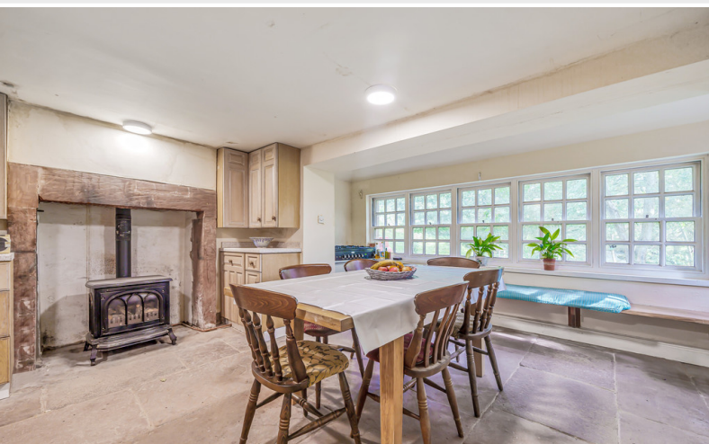
Mill House Dining Kitchen