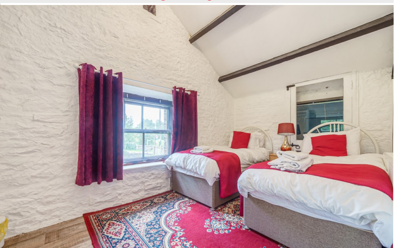
Heron Cottage Bedroom Two

Mains water and electricity. Septic tank drainage. Biomass wood pellet boiler.