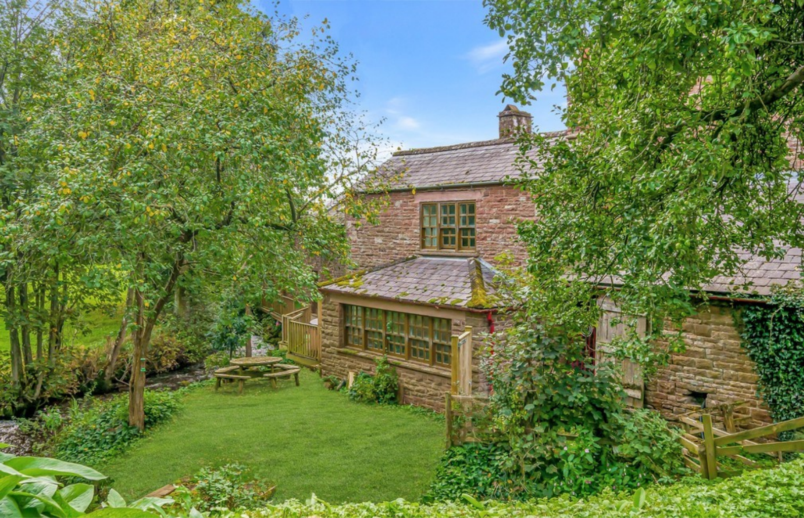
Mill House Garden