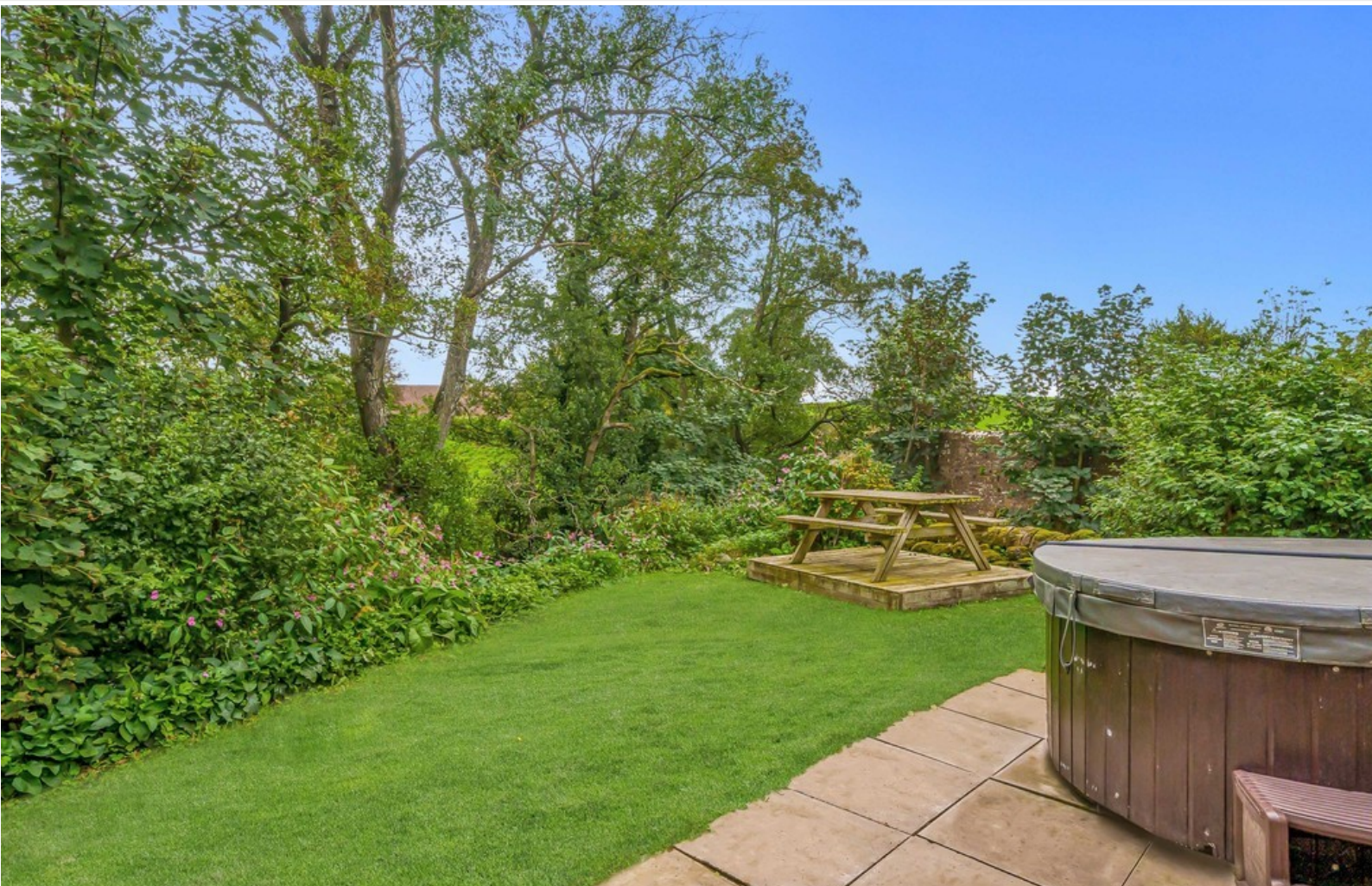
Heron Cottage Garden

Request a Viewing Online or Call 01768 593593