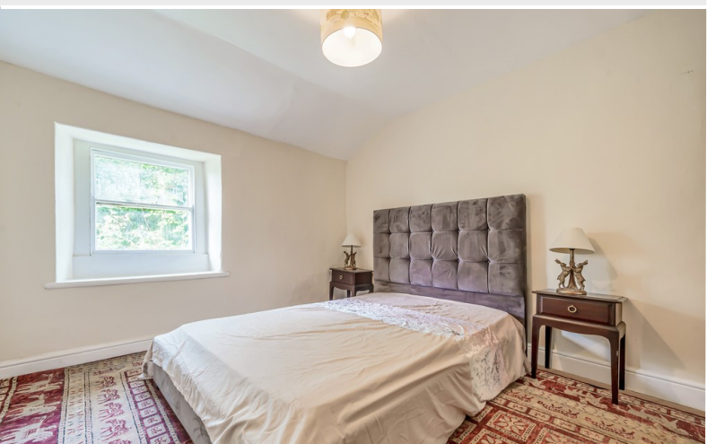
Mill House Bedroom Four

A rare opportunity to purchase a characterful traditional Grade 11 listed working flour mill originally dating before 1452 together with a substantial four bedroom main house, two adjoining two bedroom apartments successfully operating as thriving holiday lettings all set within approximately 7.9 acres of land including, grazing land, mature woodland, gardens, beck with millrace and an extensive range of outbuildings. Offering a unique lifestyle opportunity this most appealing property is delightfully situated in the village of Little Salkeld nestling within Cumbria's picturesque Eden Valley approximately six miles from Penrith and under two miles from the neighbouring village of Langwathby.