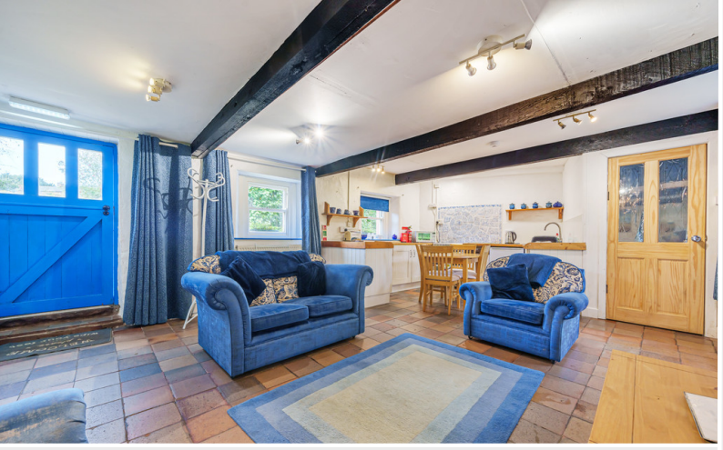
The Old Tearoom Living Room / Kitchen