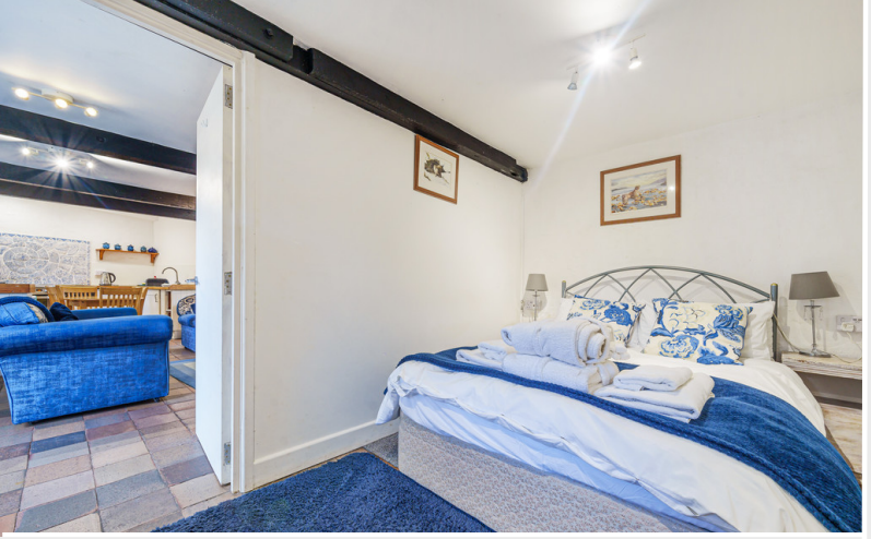
The Old Tearoom Bedroom One