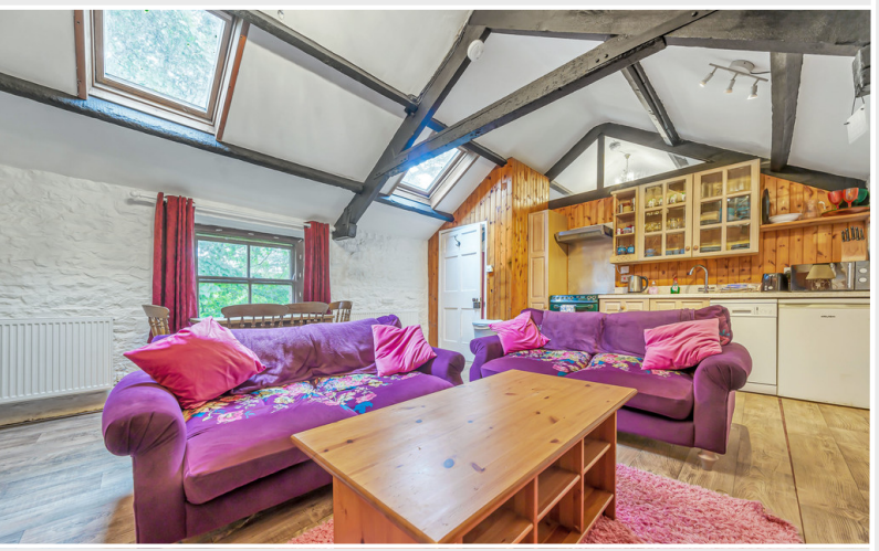
Heron Cottage Living Room / Kitchen