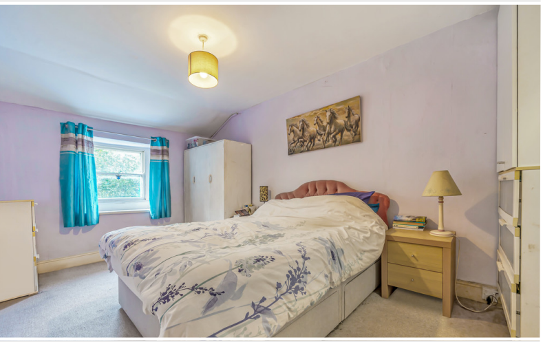
Mill House Bedroom Three