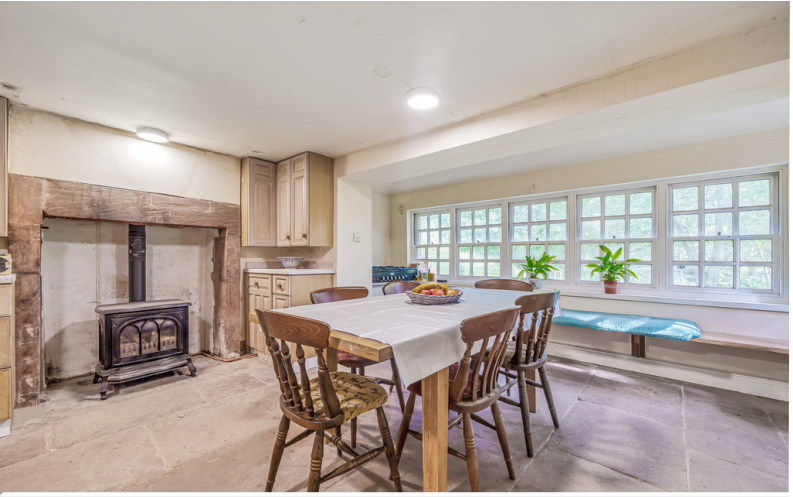
Mill House Dining Kitchen