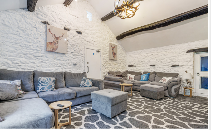
Mill House Sitting Room