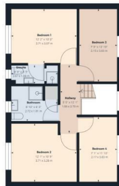
1st Floor Building 1