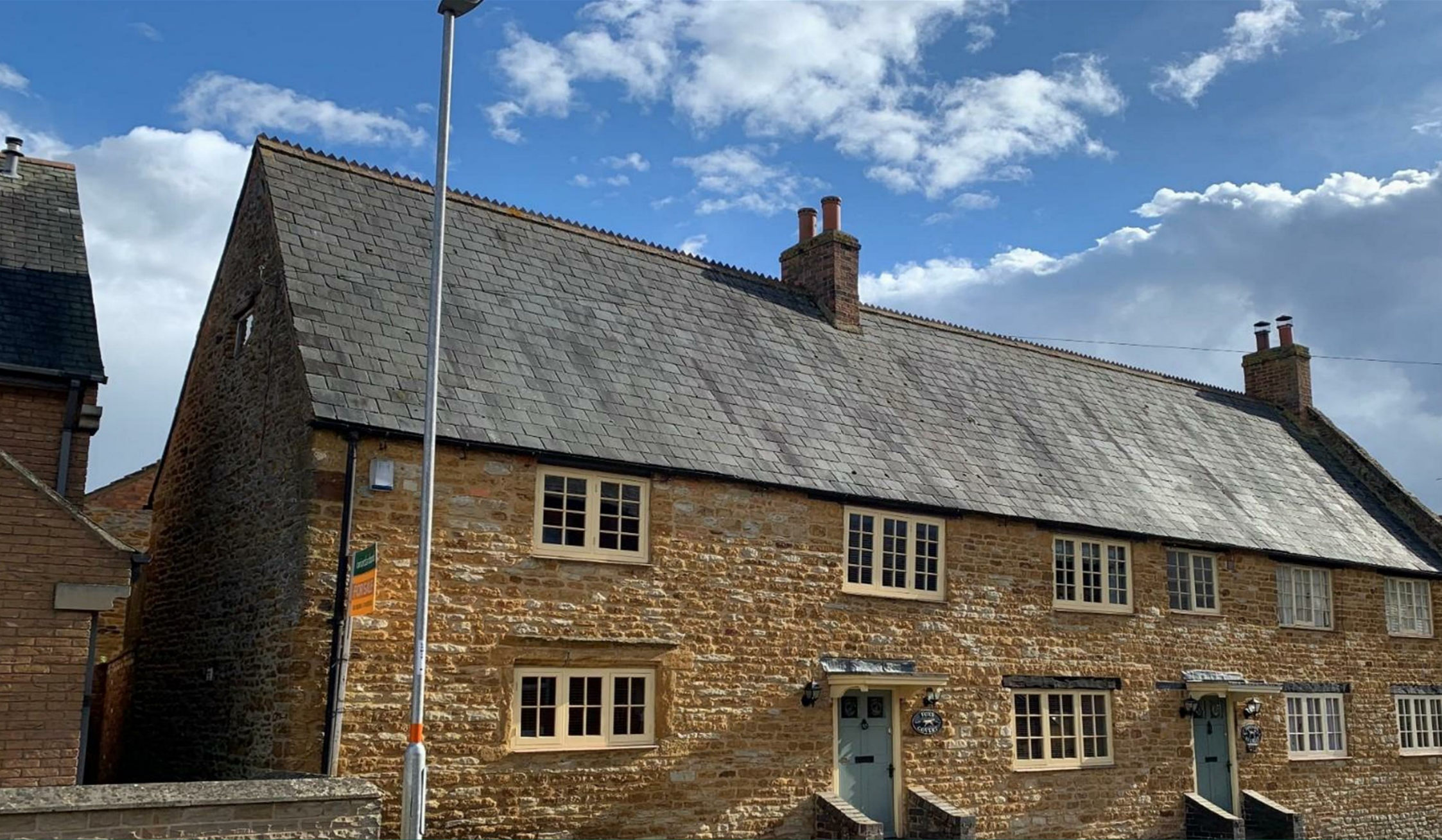
Foxs Covert, High Street Earls Barton, Northamptonshire