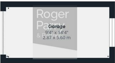
Ground floor Building 2