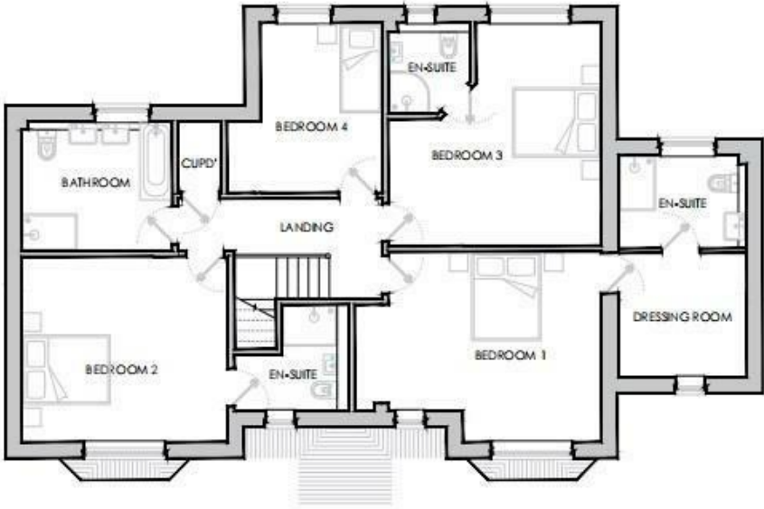
2 PROPOSED FIRST FLOOR G.A. SCALE: 1:60