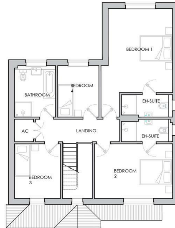
2 PROPOSED FIRST FLOOR G.A. SCALE: 1:50