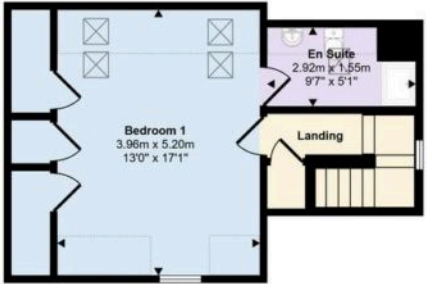
Second Floor Approx 36 sq m / 389 sq ft

This floorplan is only for illustrative purposes and is not to scale. Measurements of rooms, doors, windows, and any items are approximate and no responsibility is taken for any error, omission or mis-statement. Icons of items such as bathroom suites are representations only and may not look like the real items. Made with Made Snappy 360.