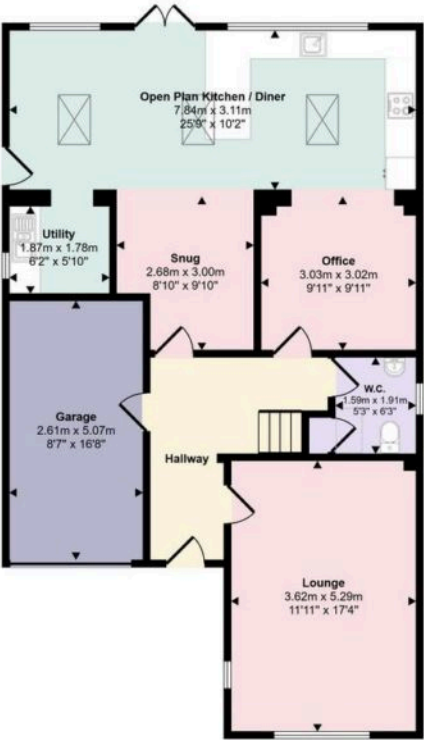
Ground Floor Approx 95 sq m / 1018 sq ft

Approx Gross Internal Area 198 sq m / 2133 sq ft