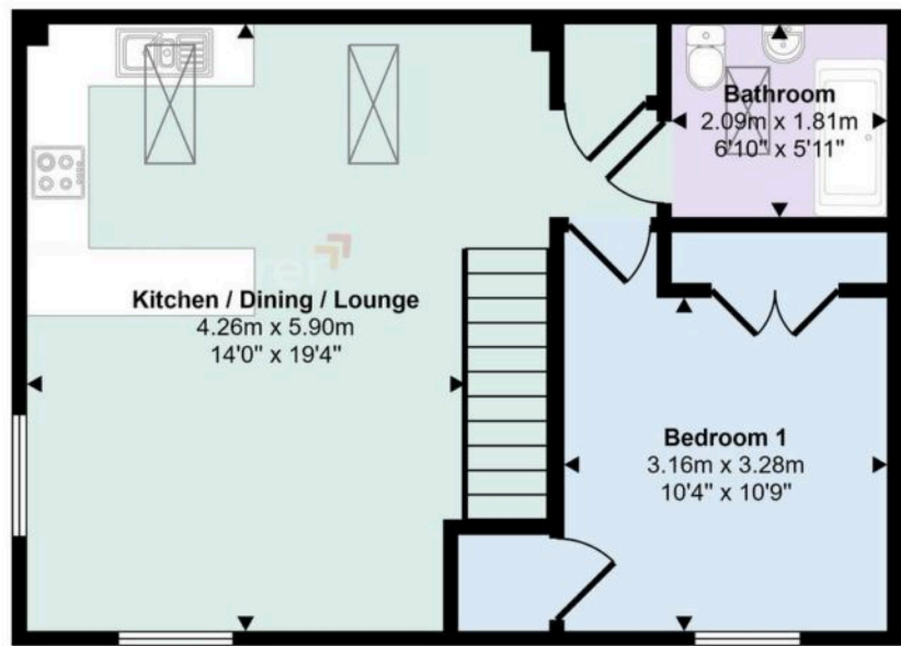
First Floor Approx 49 sq m / 531 sq ft

This floorplan is only for illustrative purposes and is not to scale. Measurements of rooms, doors, windows, and any items are approximate and no responsibility is taken for any error, omission or mis-statement. Icons of items such as bathroom suites are representations only and may not look like the real items. Made with Made Snappy 360.