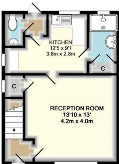
GROUND FLOOR APPROX. FLOOR AREA 372 SQ.FT. (34.6 SQ.M.)