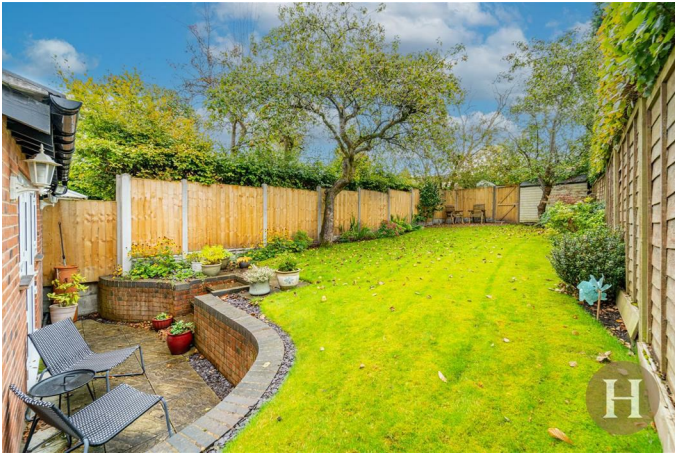
Laid patio area with steps rising to the well maintained lawn and side patio area