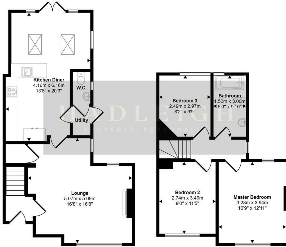
Ground Floor Approx 51 sq m / 548 sq ft

Approx Gross Internal Area 92 sq m / 985 sq ft