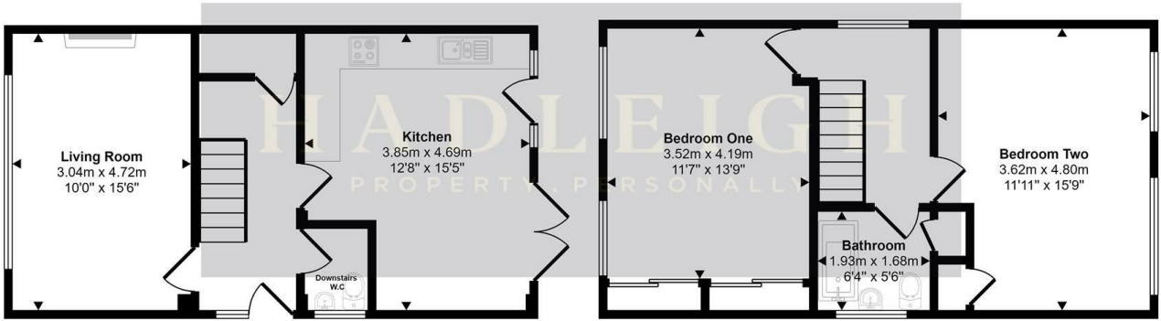
Ground Floor Approx 42 sq m / 448 sq ft

Approx Gross Internal Area 86 sq m / 924 sq ft