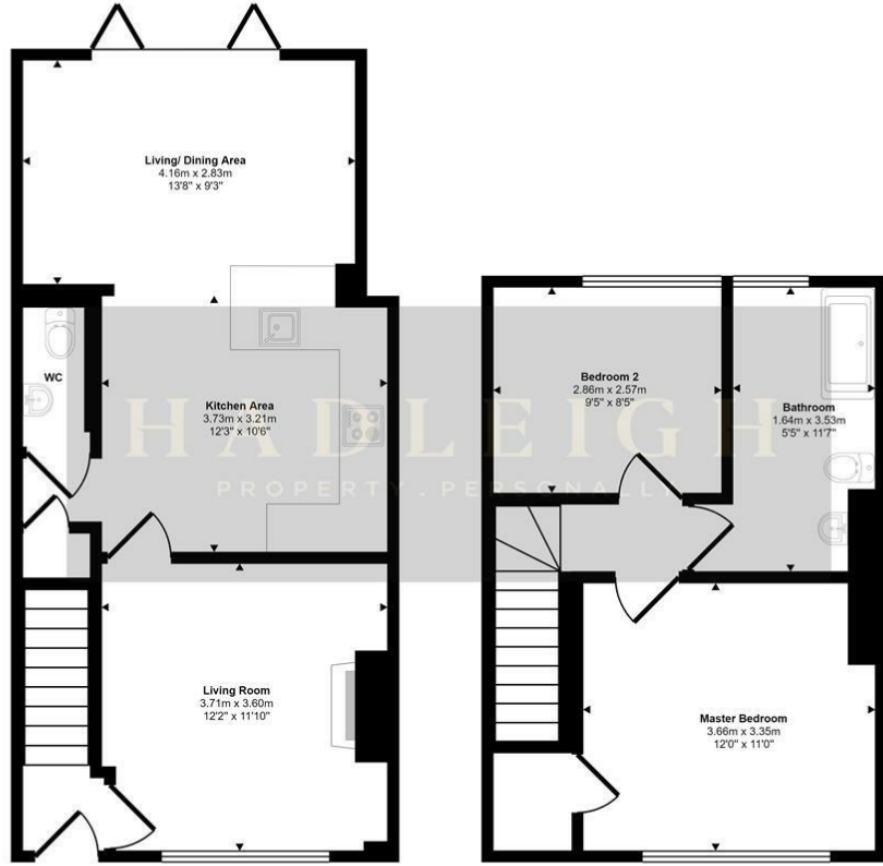
Ground Floor Approx 44 sq m / 475 sq ft

Approx Gross Internal Area 77 sq m / 833 sq ft