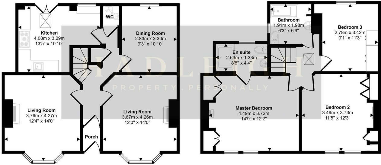
Ground Floor Approx 61 sq m / 662 sq ft

Approx Gross Internal Area 117 sq m / 1259 sq ft