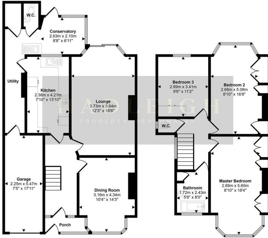
Ground Floor Approx 88 sq m / 947 sq ft

Approx Gross Internal Area 143 sq m / 1536 sq ft