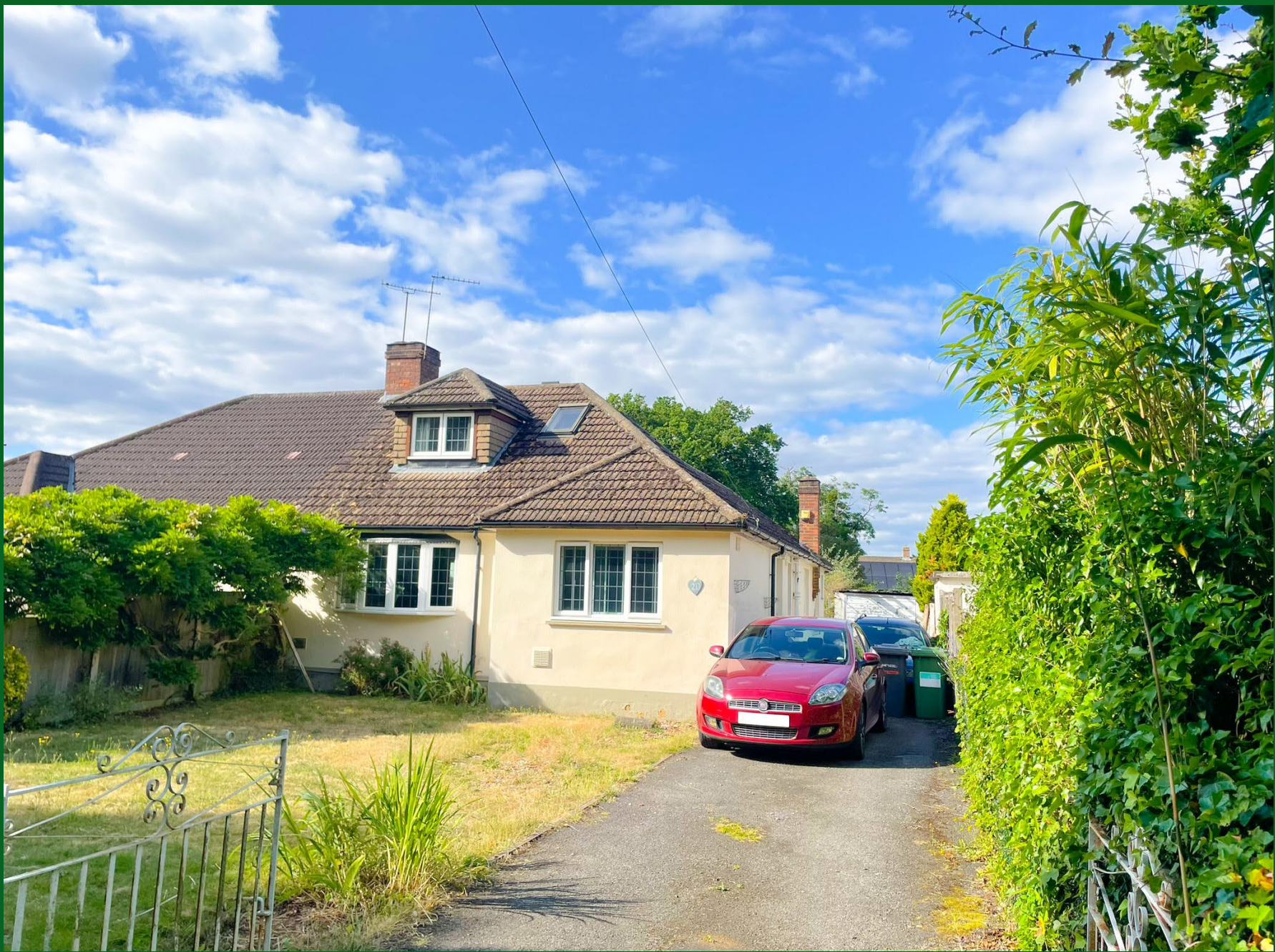
Wraysbury, Berkshire Guide price £660,000 Freehold