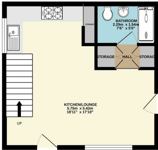
GROUND FLOOR 31.2 sq.m. (336 sq.ft.) approx.