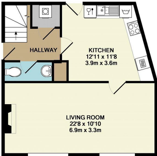
GROUND FLOOR APPROX. FLOOR AREA 491 SQ.FT. (45.6 SQ.M.)