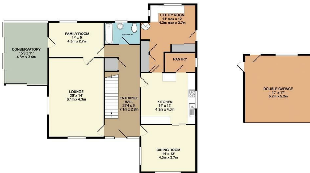
GROUND FLOOR APPROX. FLOOR AREA 1708 SQ.FT. (158.7 SQ.M.)