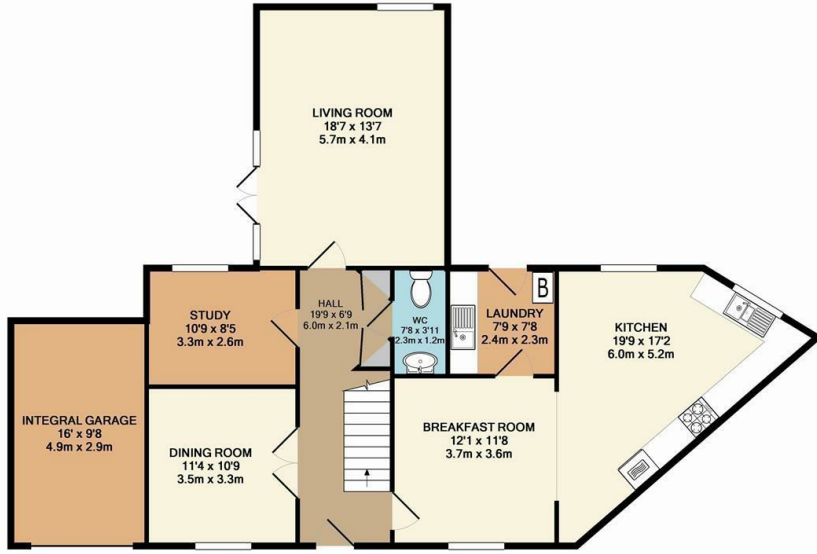
GROUND FLOOR APPROX. FLOOR AREA 1201 SQ.FT. (111.5 SQ.M.)