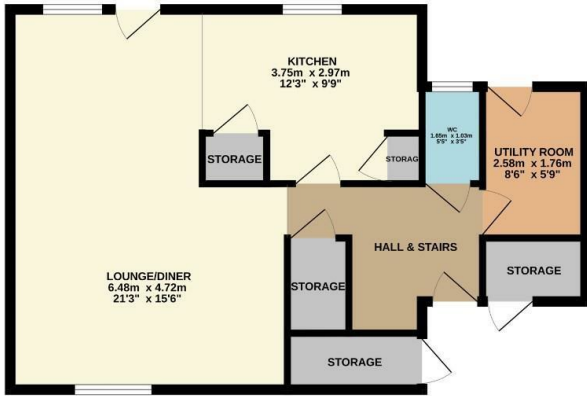
GROUND FLOOR 55.7 sq.m. (599 sq.ft.) approx.