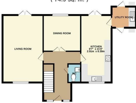
GROUND FLOOR 806 sq. ft. ( 74.9 sq. m. )