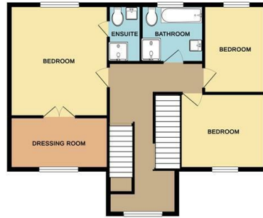
1ST FLOOR 734 sq. ft. ( 68.2 sq. m. )