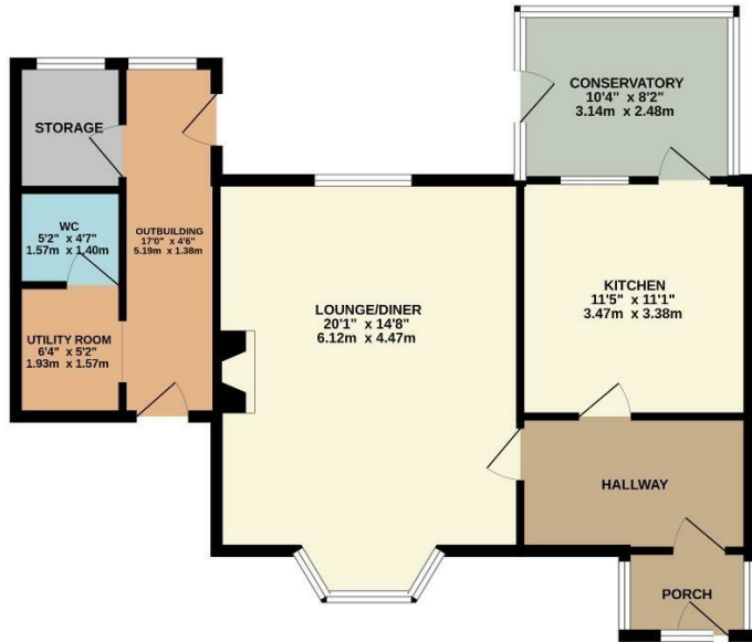
GROUND FLOOR 739 sq.ft. (68.7 sq.m.) approx.