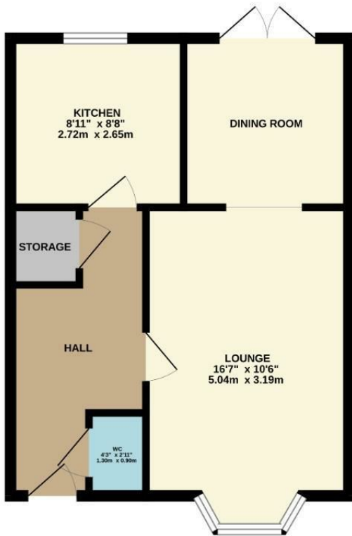
GROUND FLOOR 418 sq.ft. (38.8 sq.m.) approx.