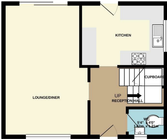
GROUND FLOOR 410 sq.ft. (38.1 sq.m.) approx.