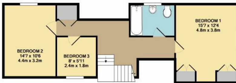
1ST FLOOR APPROX. FLOOR AREA 631 SQ.FT. (58.6 SQ.M.)

TOTAL APPROX. FLOOR AREA 1772 SQ.FT. (164.6 SQ.M.)