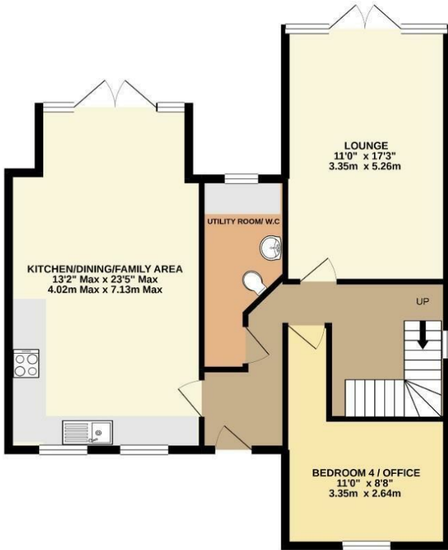
GROUND FLOOR 792 sq.ft. (73.5 sq.m.) approx.