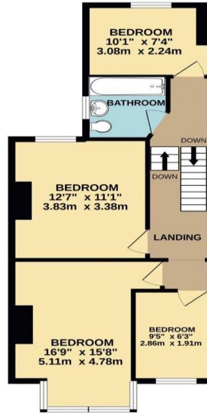
1ST FLOOR 552 sq.ft. (51.3 sq.m.) approx.