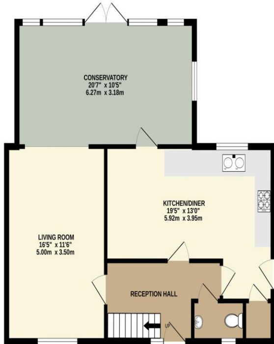
GROUND FLOOR 721 sq.ft. (67.0 sq.m.) approx.