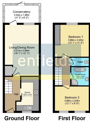
This plan is for illustration purposes only and may not be representative of the property. Plan not to scale.