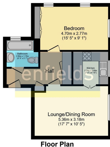
This plan is for illustration purposes only and may not be representative of the property. Plan not to scale.