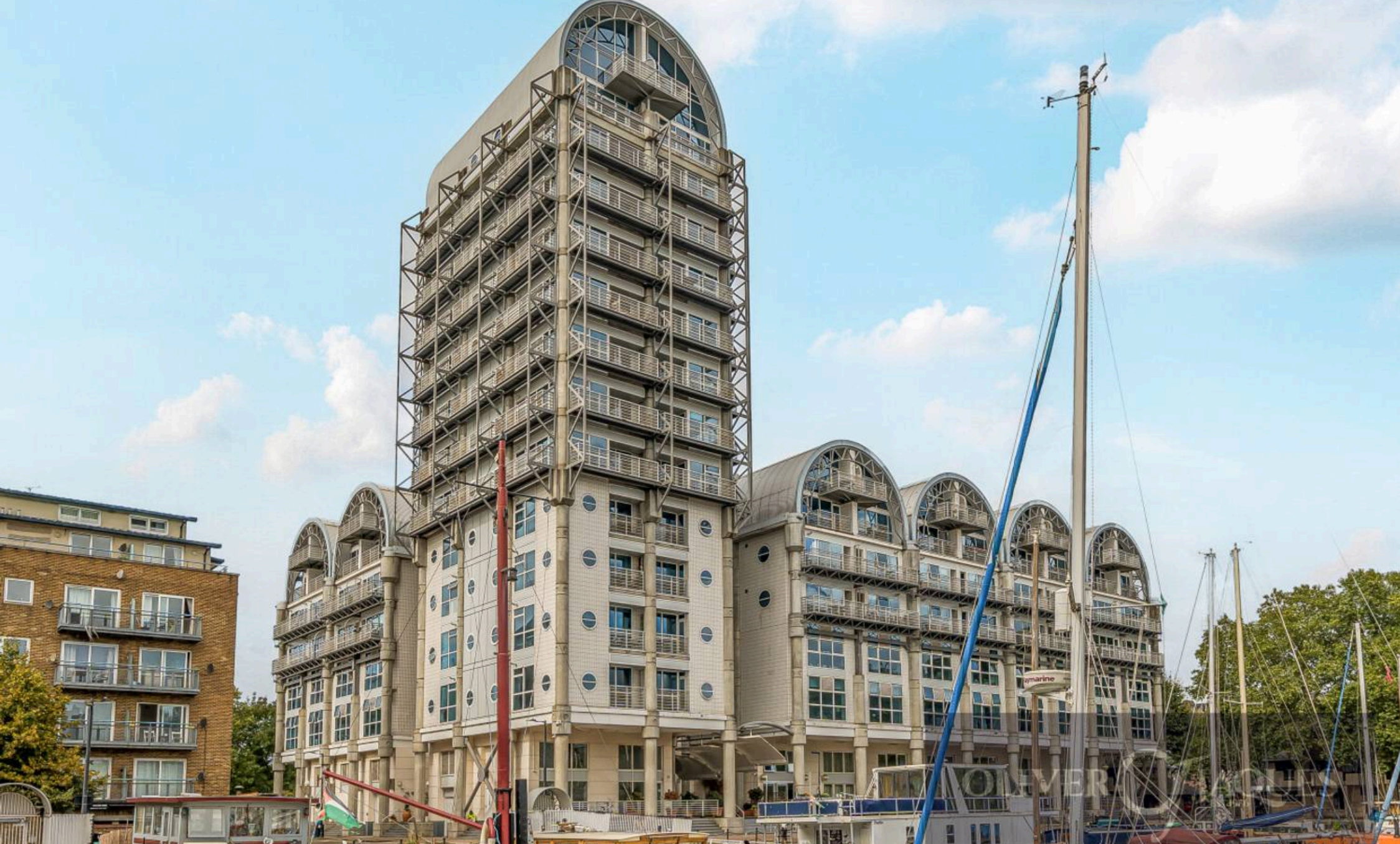
Baltic Quay, 1 Sweden Gate London