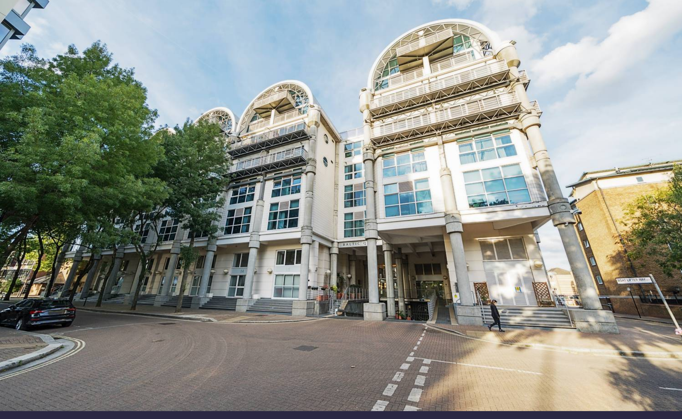
Flat 14, Baltic Quay, 1 Sweden Gate