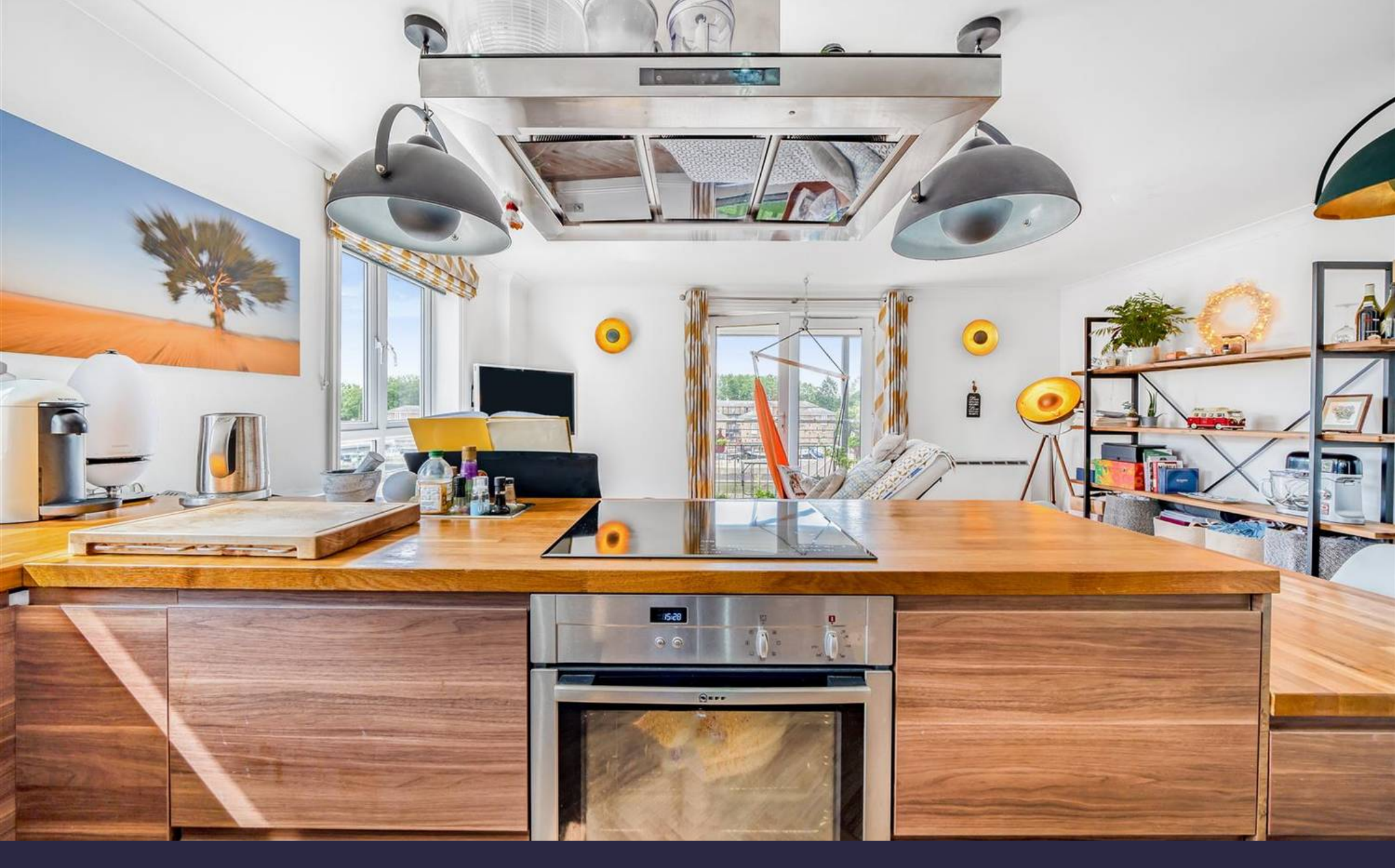
Flat 6, 6 Rainbow Quay, London