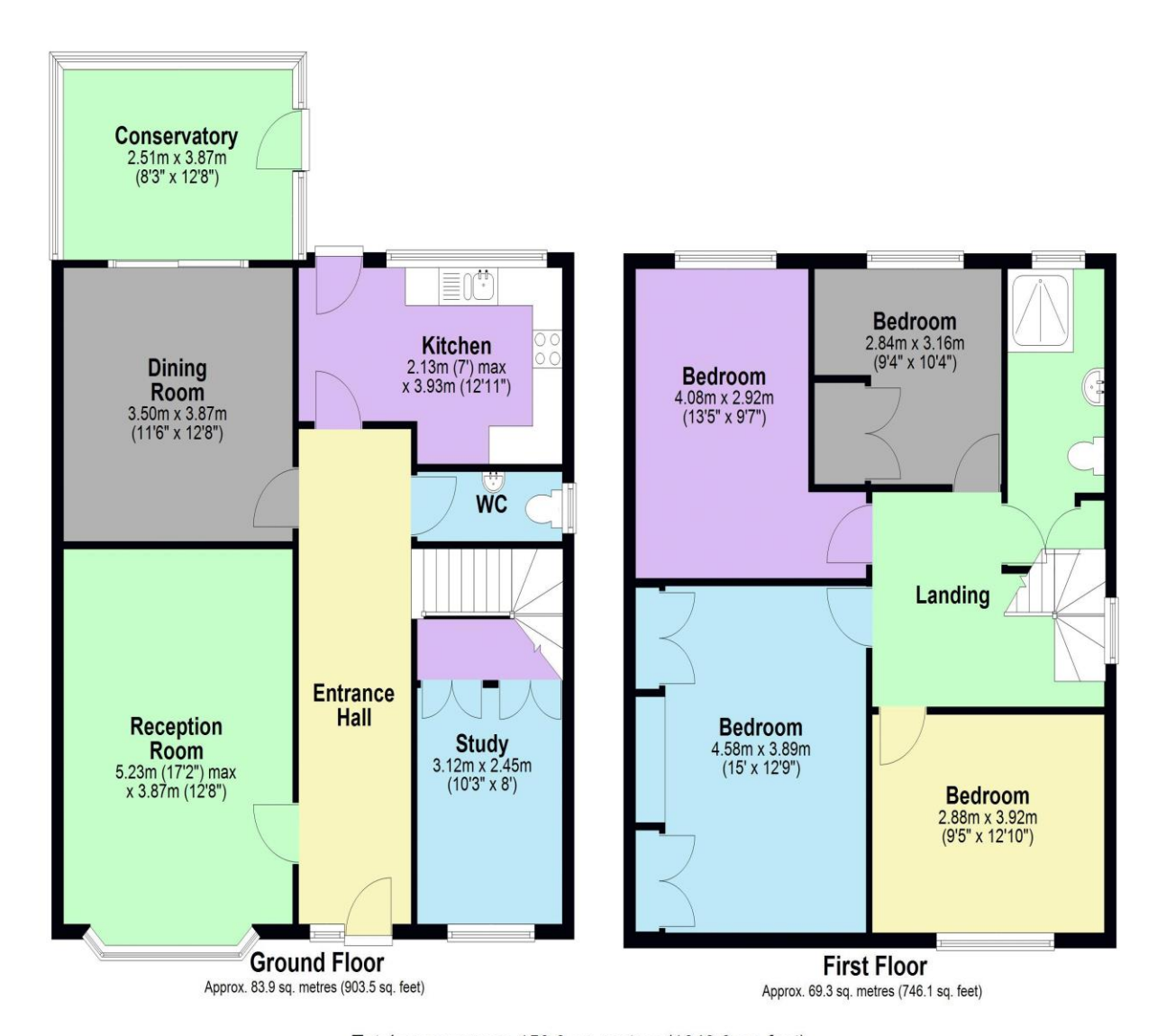
Total area: approx. 153.3 sq. metres (1649.6 sq. feet)