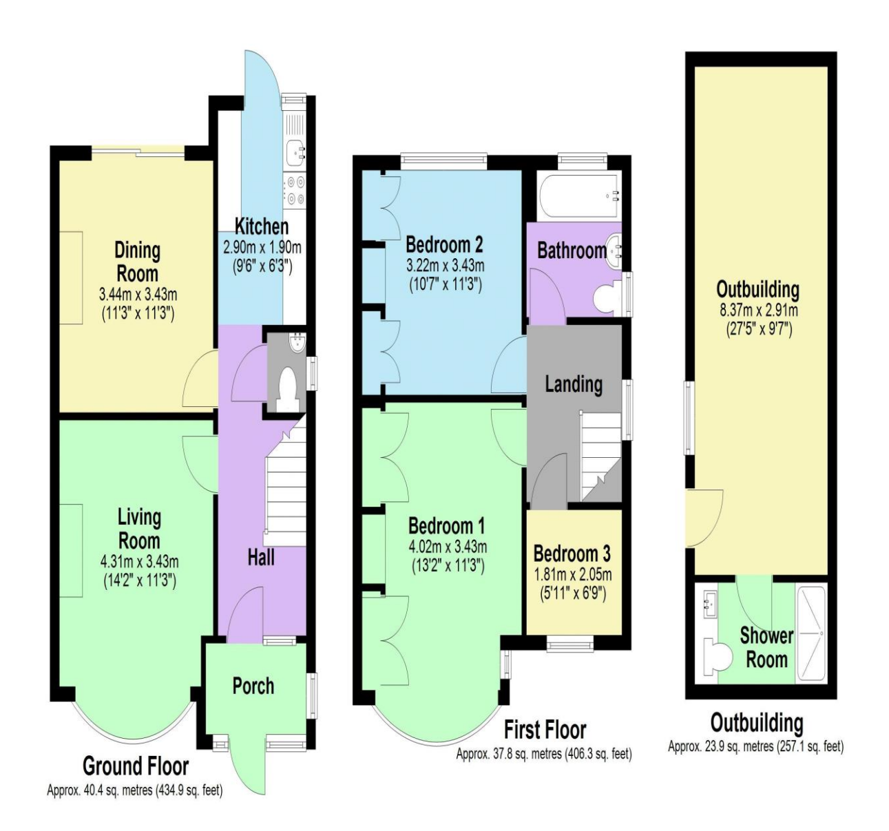
Total area: approx. 102.0 sq. metres (1098.4 sq. feet)