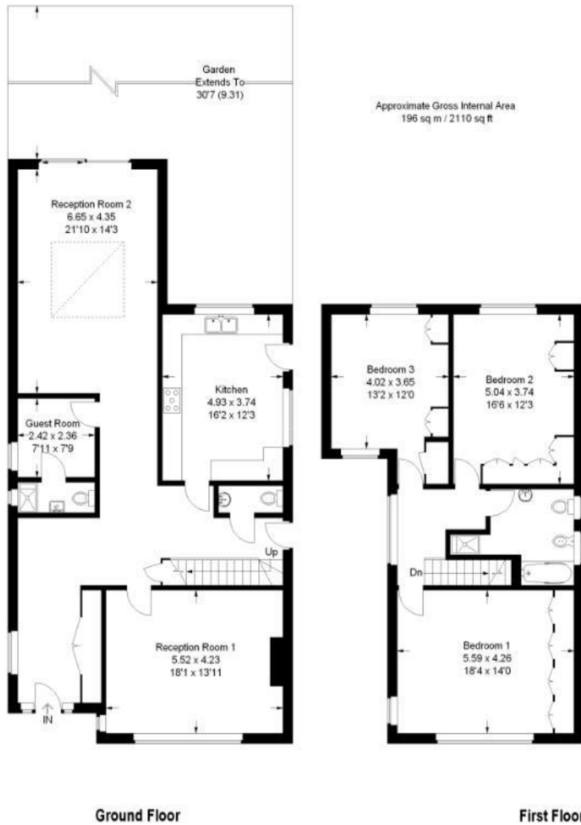
Illustration for identification purposes only, measurements are approximate, not to scale. FloorplansUsketch.com © 2013 (ID64909)