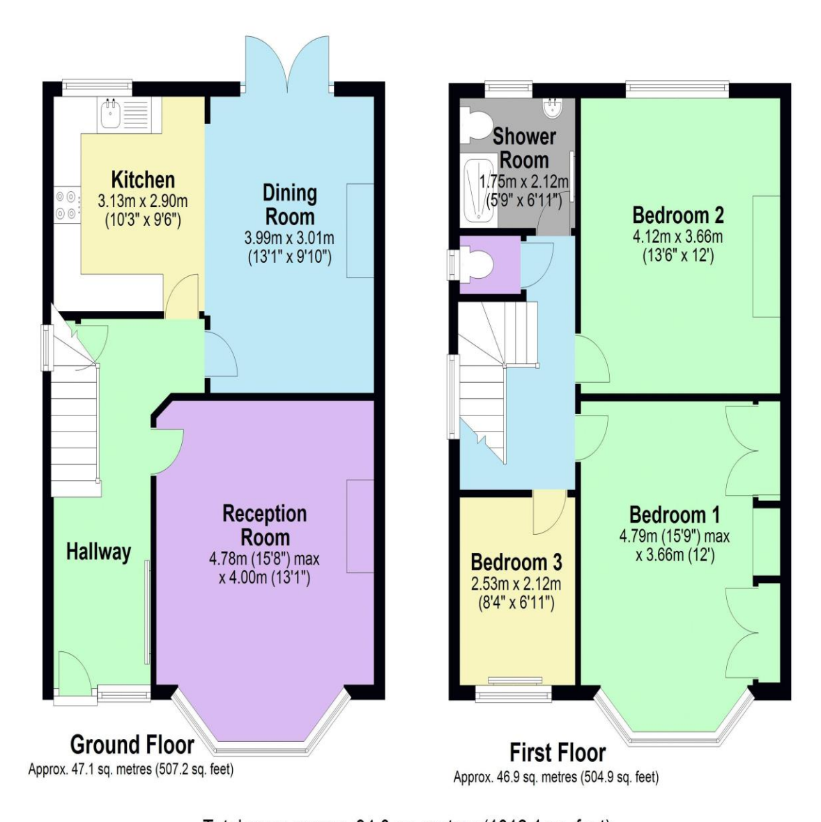
Total area: approx. 94.0 sq. metres (1012.1 sq. feet)