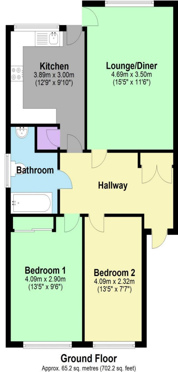
Approx. 65.2 sq. metres (762.2 sq. leet)

Total area: approx. 65.2 sq. metres (702.2 sq. feet)