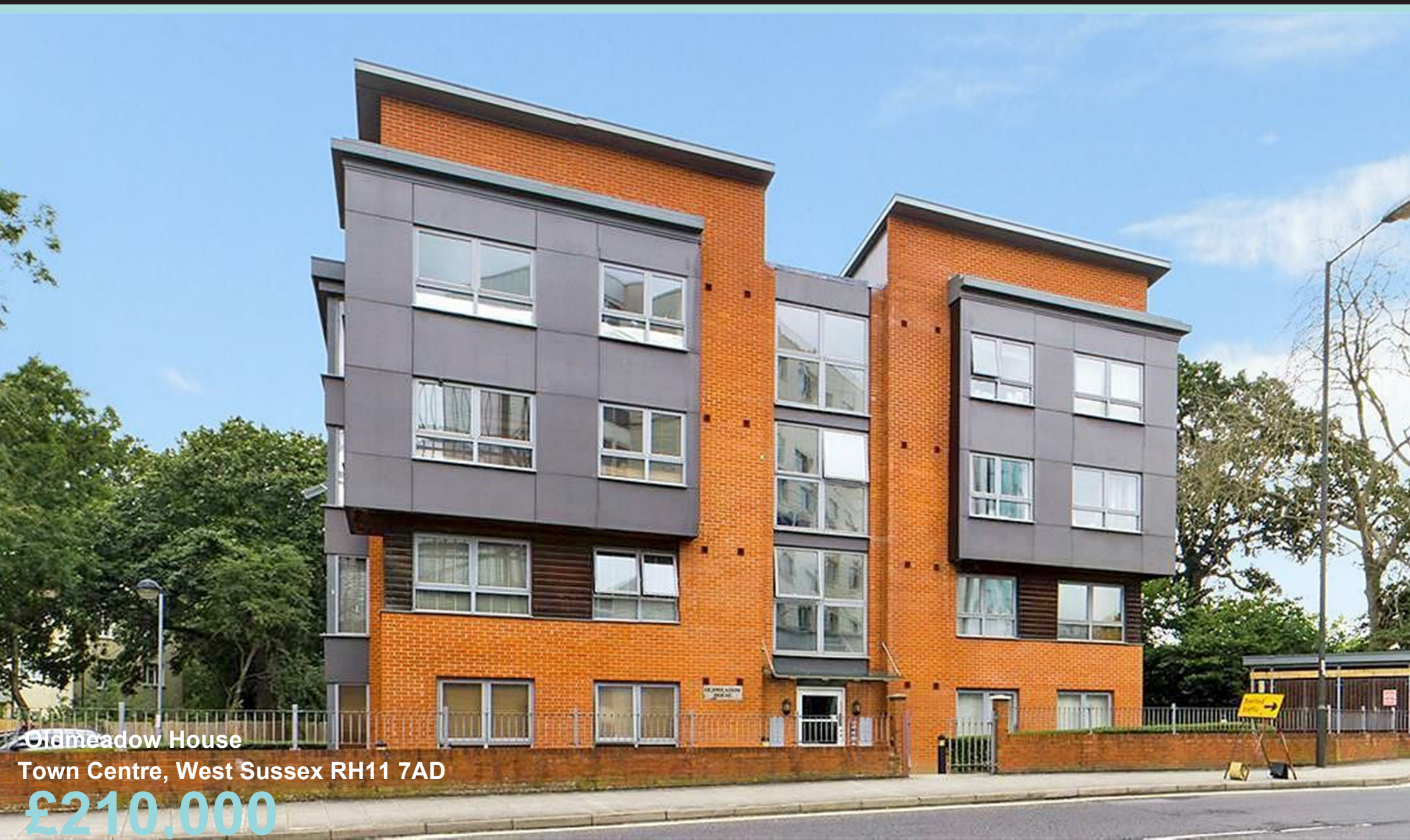
Oldmeadow House Town Centre, West Sussex RH11 7AD