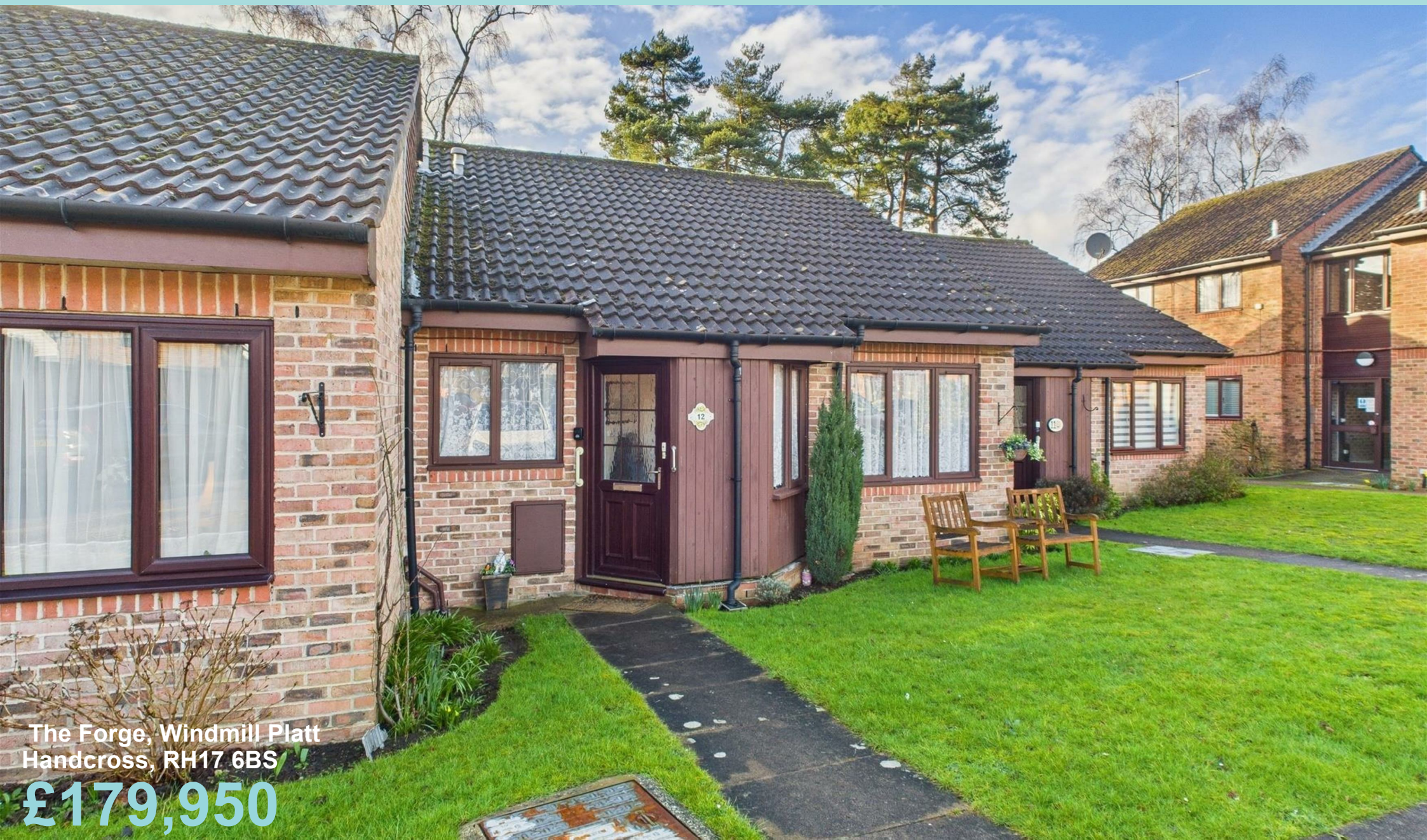
The Forge, Windmill Platt Handcross, RH17 6BS