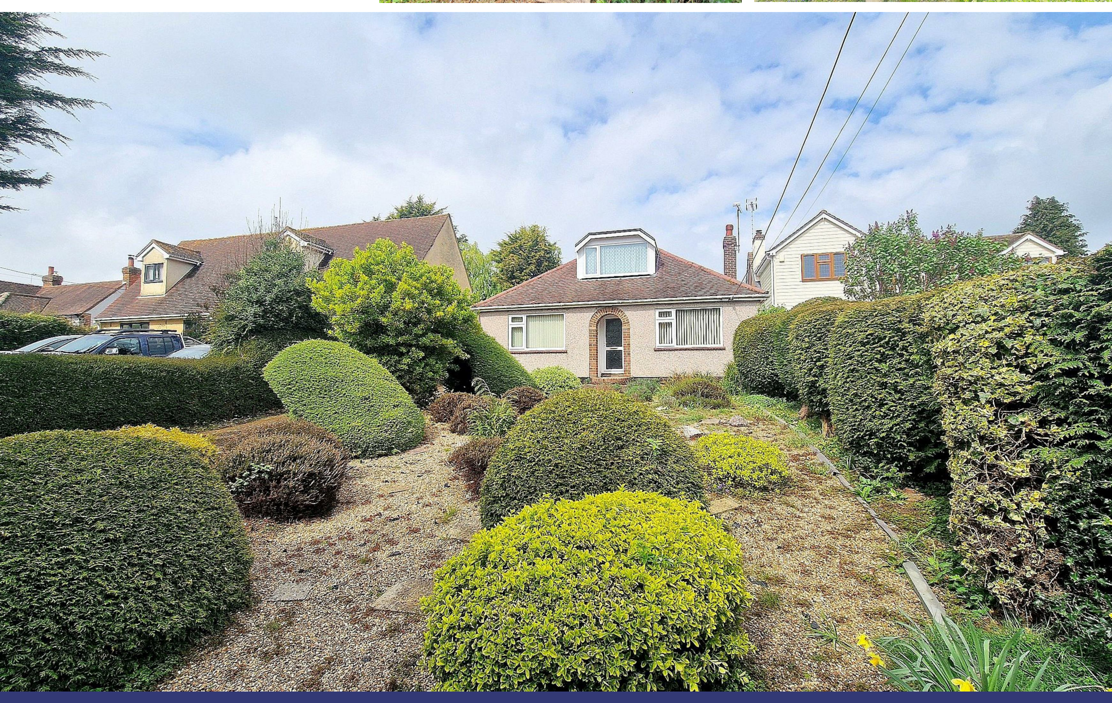
37 Conduit Lane, Woodham Mortimer , Essex CM9 6SZ Guide price £500,000