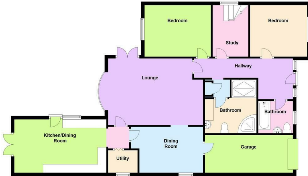
Ground Floor Approx. 1285.6 sq. feet