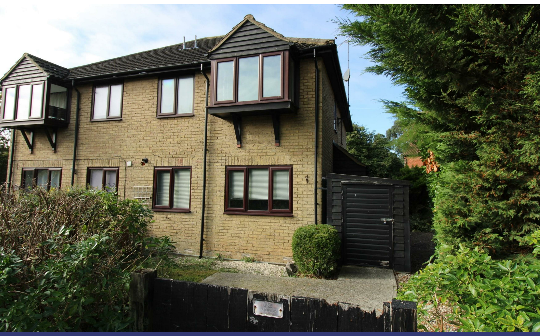
72 Brockenhurst Way, Bicknacre, Essex CM3 4XW £900 PCM